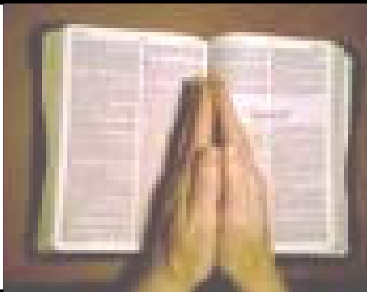
"Lord, teach us to pray just as John taught his disciples."