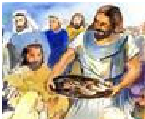
...performs miracles of the loaves and fishes..

WANT MARRIAGE BLESSED? Highly recommended if marriage not celebrated in the Church. Call the Rectory office or see the priest.