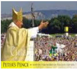
PETER'S PENCE - HELP THE MOST DISADVANTAGED

Next week we will take up the Peter's Pence Collection, which provides the Holy Father with the assistance he needs to carry out his most important charitable works. The proceeds benefit the most disadvantaged: victims of war, oppression, and disasters. Through your generosity, with Pope Benedict we can cast the love of Christ upon the world.,